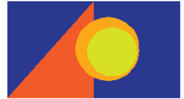
Terrano Islands flag

The Terrano Islands are a small archipelago in the Pacific Ocean. They are located at approximately 16°N, 172°W, just southwest of Hawaii.